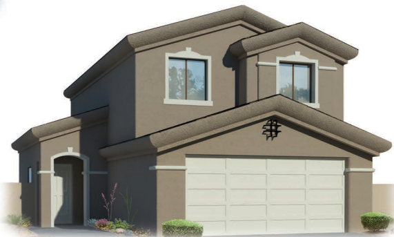
ELEVATION OPTION 1