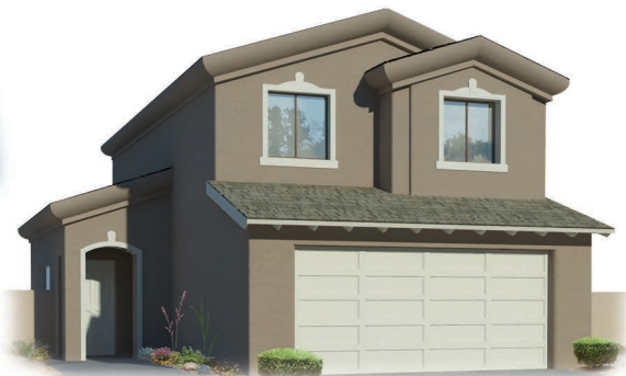
ELEVATION OPTION 2